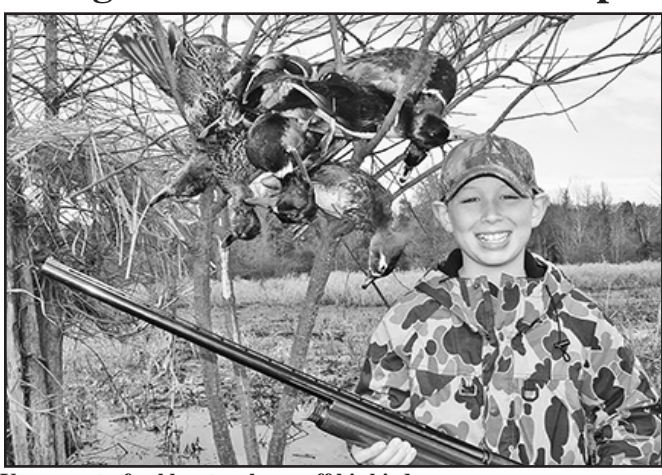
Young waterfowl hunter shows off his birds

With waterfowl hunting season opening Sat., Nov. 18, duck and goose hunters across Georgia should face much better hunting conditions than last year, according to experts with the Georgia Department of Natural Resources' Wildlife Resources Division (WRD).